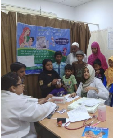
Photographs (maximum 04) of the Department/Departmental activity