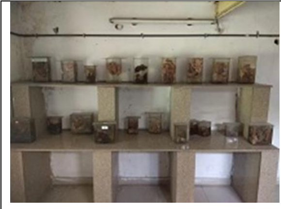
Photographs of the Department/Departmental activity:-